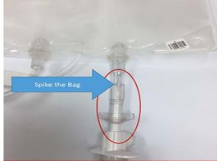
It is not necessary to bring the tip of the spike inside the bag, make sure that the connection is tight.